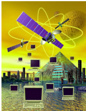
Ideas to Fruition

SUCCESS: Plan to Succeed ... When failure is not an option, a project's prospects for success can be enhanced by good management, planning, organisation, budgeting, reporting and recognised accountability.